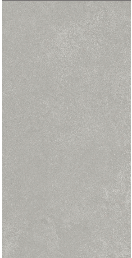
GREY Matte Finish

60 x 60 cm (24" x 24") DC.ES.WHT.2424.REC