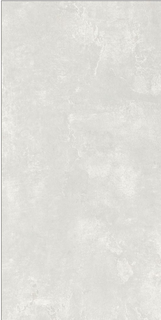
WHITE Matte Finish

30 x 60 cm (12" x 24") DC.ES.WHT.1224.REC